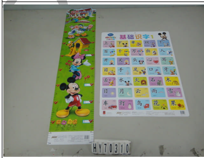
Sample picture (As received)