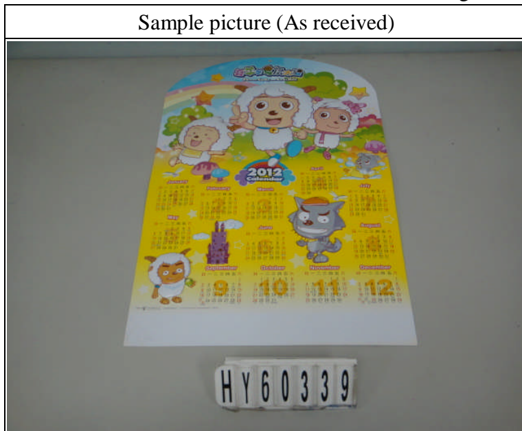
Sample picture (As received)