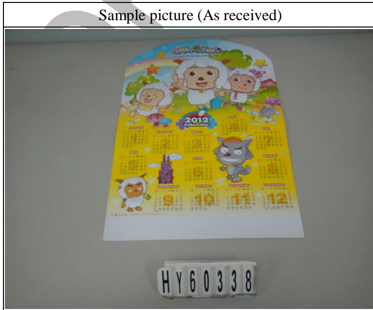
Sample picture (As received)